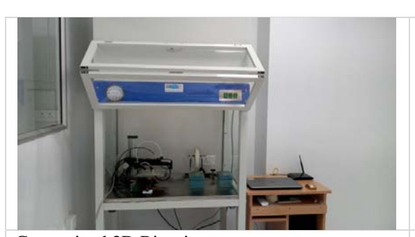
Customized 3D Bioprinter