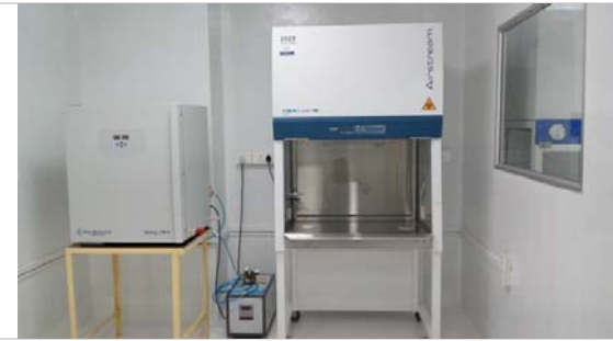
Biosafety cabinet, CO2 incubator